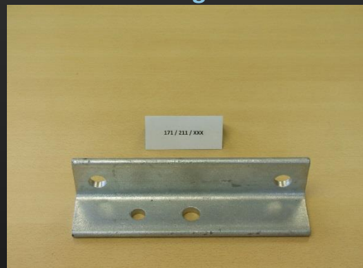
171/211/XXX Termination Angle with Holes