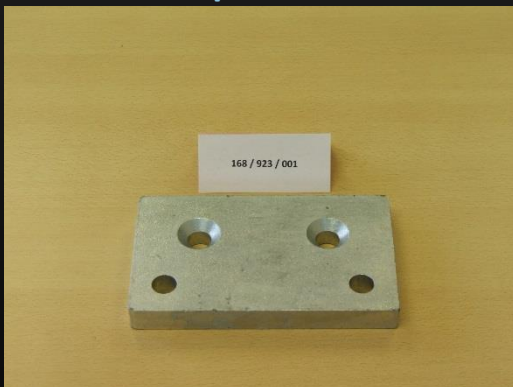
168/923/001 Adapter Plate