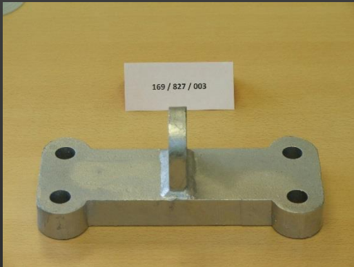
169/827/XXX Headspan Wire Termination Bracket