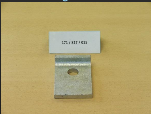
171/827/XXX Angle Cleat