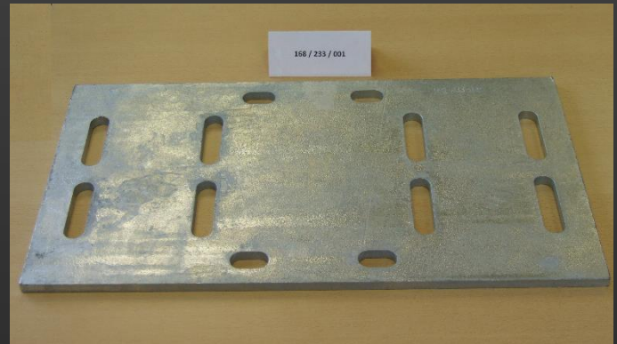
168/233/001 260 x 480 Plate